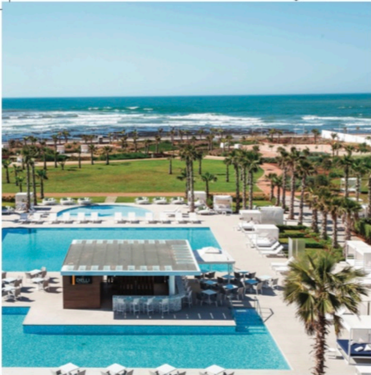
VICHY CELESTINS CASABLANCA

and a heated recovery pool. Water therapies are at the forefront, like the famed Vichy shower treatment, which involves lying under a horizontal shower as oils are massaged all over. Everything has been thought of: the VIP area for ultimate luxury and discretion, the post-treatment tea room, the choice between Vichy products and marocMaroc, a luxury organic Moroccan brand.