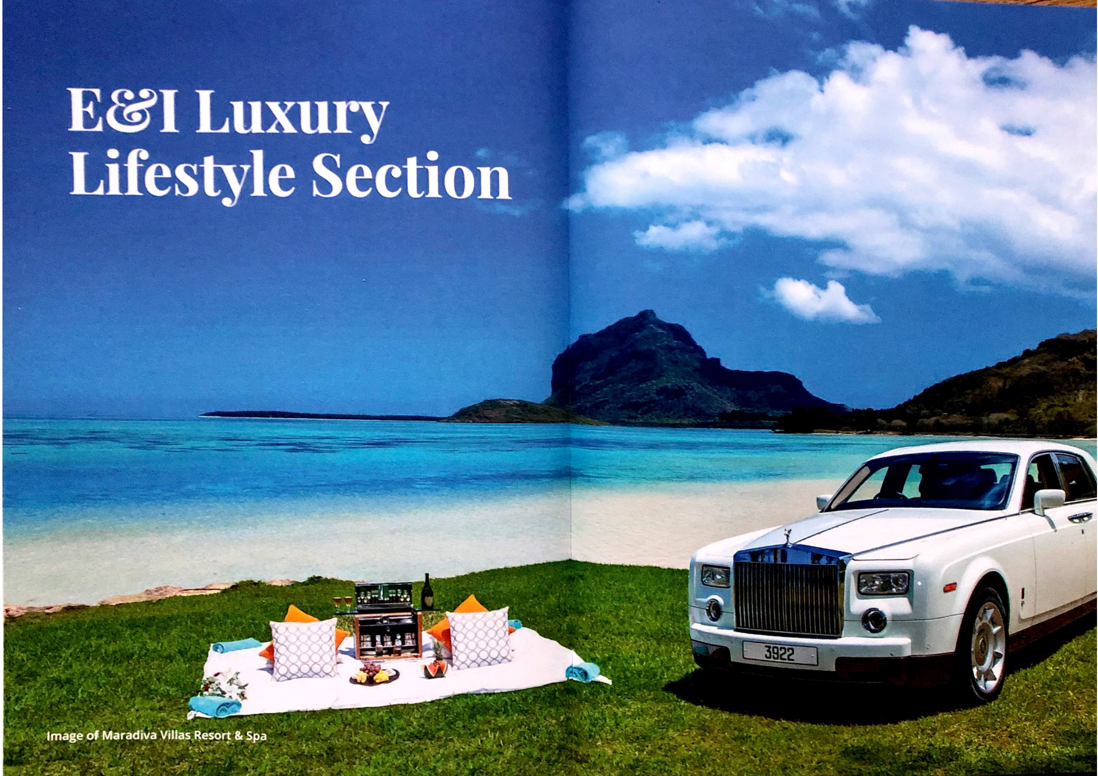
Image of Maradiva Villas Resort & Spa