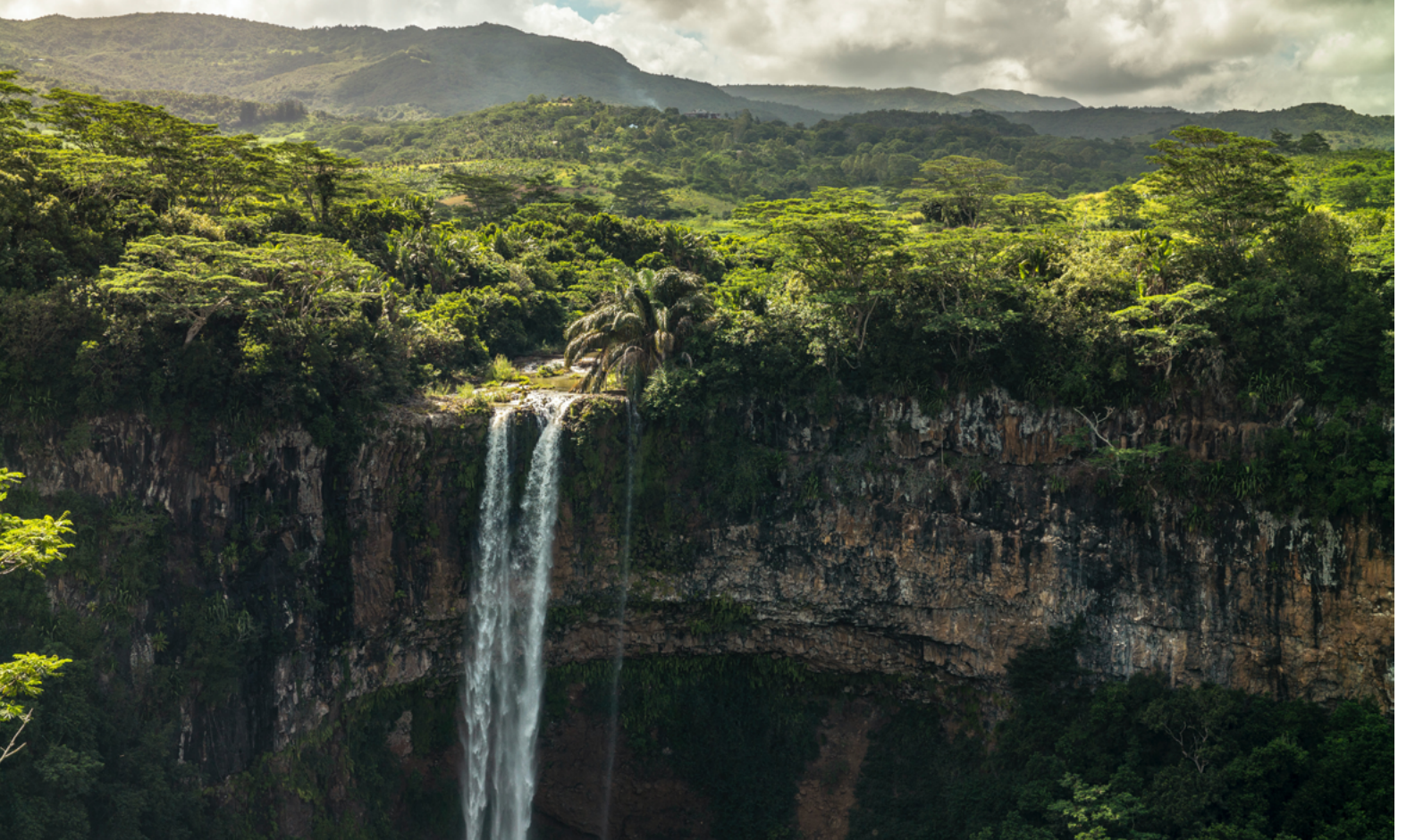
Black River Gorges National Park, photo: Fabienne Sypowski-Meyer