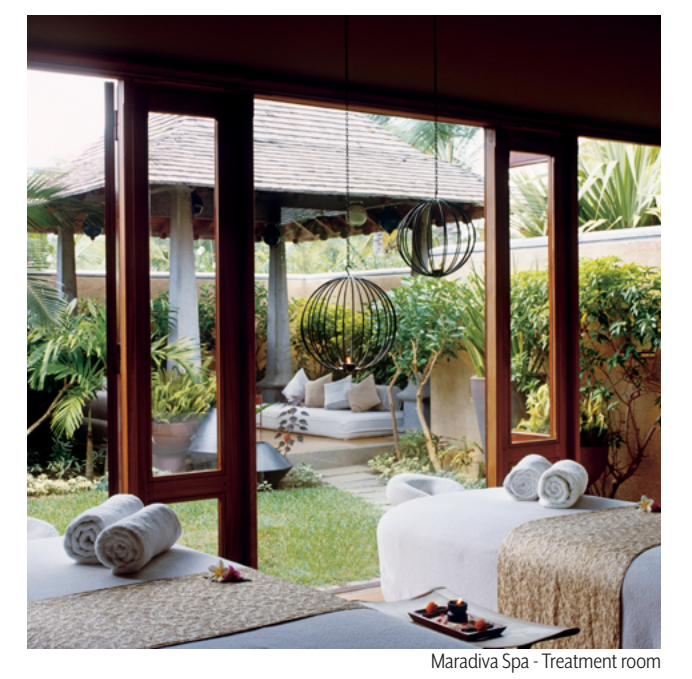
At Maradiva there is a lot to do and experience. The five-star luxury resort is a member of the exclusive 'Leading Hotels of the World' group, perfect for those seeking a stunning and private personalised Mauritian experience. Synonmous with romance, given the island's renown for honeymooners, the resort does cater for everyone. Boasting 46 Luxury Suite Pool Villas, 11 Beachfront Luxury Suite Pool Villas, 6 Exclusive Suite Pool Villas and two Presidential Suite Pool Villas, you're spoilt for choice, at a price that guarantees privacy and faultless service.

t Maradiva there is a lot to do and experience.