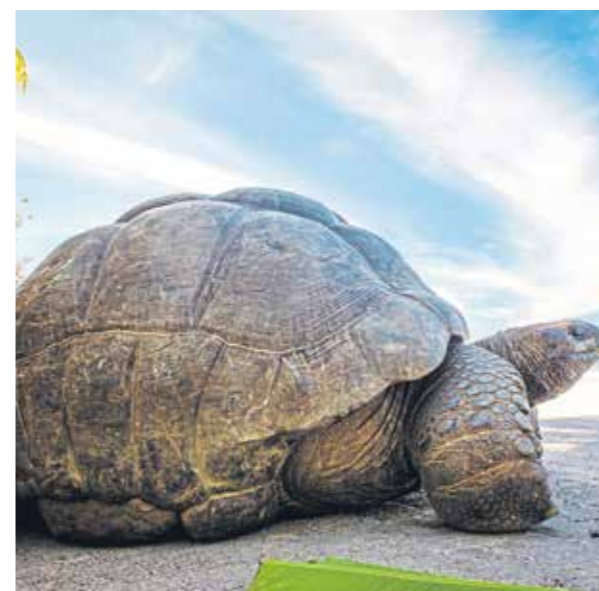
Waterfalls, massages, delicious seafood, ancient volcanoes and giant tortoise Big Daddy are among the reasons to get out of your luxury bed in the morning.