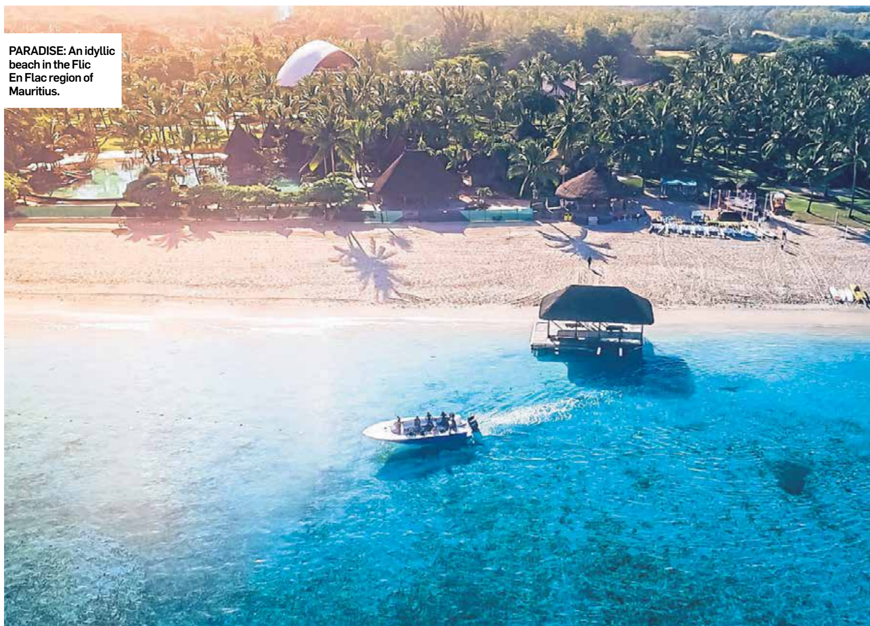
PARADISE: An idyllic beach in the Flic En Flac region of Mauritius.