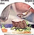
Fine dining: Sea Cloud Spirit has two restaurants

The magic of being powered by the wind and 41,000 sq ft of canvas provides sheer joy.