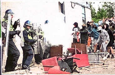
Disgrace to the flag: Man in a Union Jack mask at Holiday Inn that came under attack (right)