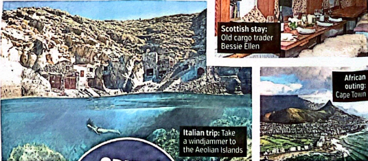
Scottish stay: Old camp trader Bessie Ellen

Among Sea Cloud's trio of windjammers, the 100 ft is an opionymous, 64-passenger beauty who comes with