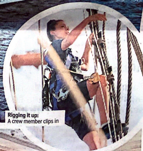
Rigging it up: A crew member clips in

It's all hands on deck on the majestic Sea Cloud Spirit sailing cruise, as Sabi Phagura discovers